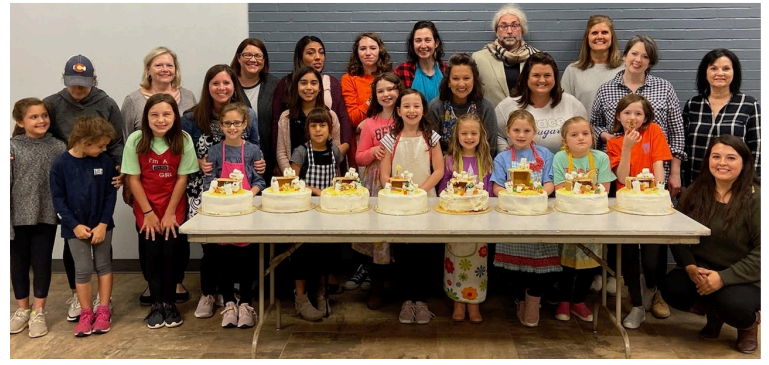
NAILED IT Mother and Daughter Event Saturday, November 9, 2019